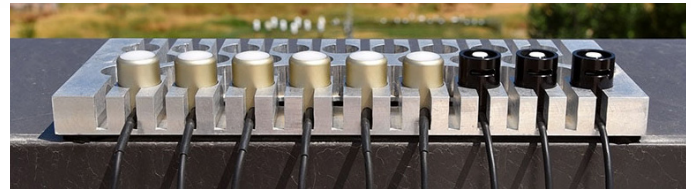
Figure 1. Six CS310 quantum sensors (manufactured by Apogee) and three LI190R quantum sensors (manufactured by LI-COR) monitor sunlight for the comprehensive research study.

Photosynthetically active radiation (PAR) is defined as the photosynthetic photon flux density (PPFD), the sum of photons between 400 and 700 nm, with units of \mu\text{mol}/\text{m}^2/\text{s} (micromoles of photons per meter squared per second). Quantum sensors, also known as PAR sensors, measure the PPFD. This document compares the two research grade quantum sensors offered by Campbell Scientific—the CS310 and the LI190R (Figure 1). It uses data from a comprehensive study that compared eight different types of quantum sensors (Blonquist and Johns. May, 2018 a ).