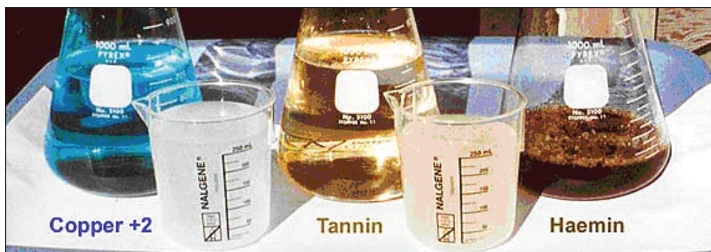
Figure 1. Water used in the test was colored blue with copper and brown with Haemin.

D & A Instrument Company conducted tests with dissolved organic and inorganic materials to identify the threshold conditions where OBS function is substantially impaired. They defined substantial as a 10% reduction in indicated turbidity. OBS sensors operate in the NIR band so they are color blind. That is color perceived by an operator has no direct influence on OBS function. However, color can indicate the presence of materials that are strongly absorbing in the operating spectrum. The inorganic absorber was a blue, Copper +2 dye with an absorptivity, \epsilon , of 23 \text{ cm}^{-1} \text{ M}^{-1} and the organic dye was a brown, haemin-based compound with an \epsilon = 1450 \text{ cm}^{-1} \text{ M}^{-1} (see Figure 1).