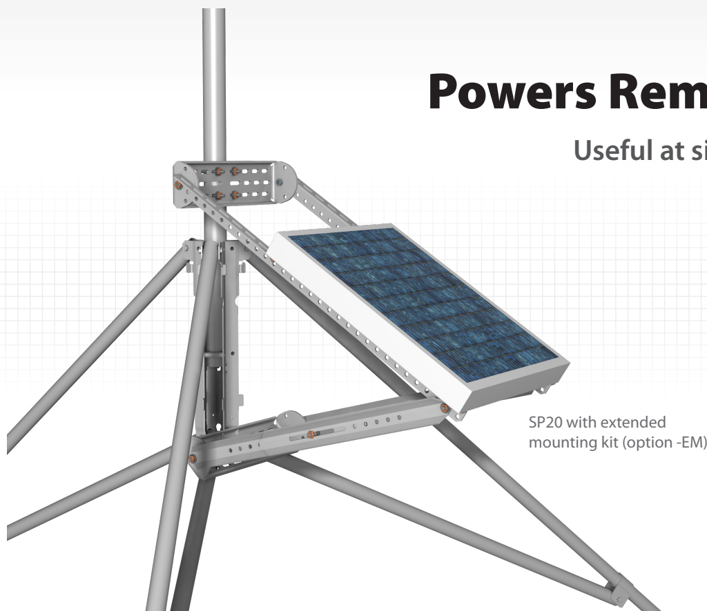
SP20 with extended mounting kit (option -EM)