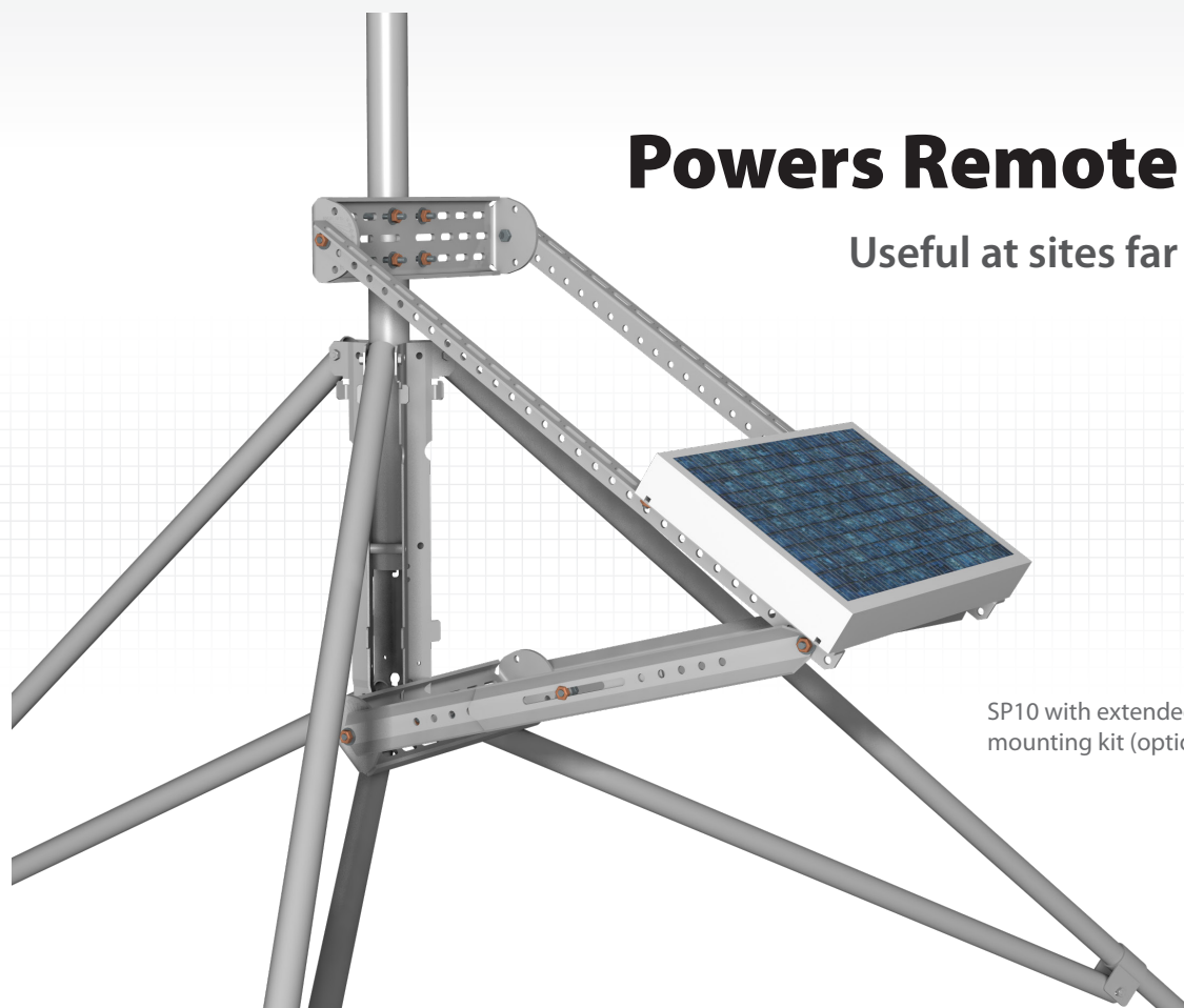
SP10 with extended mounting kit (option -EM)