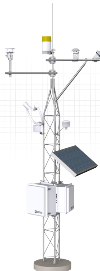
Solar1000 Customized for PG&E