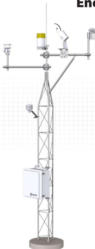
Solar1000-SCE Meets CAISO, SCE Compatible