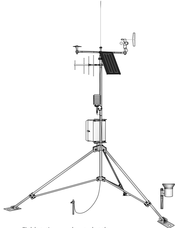
Field stations are located at the measurement site. This field station uses a Yagi antenna to transmit the data.