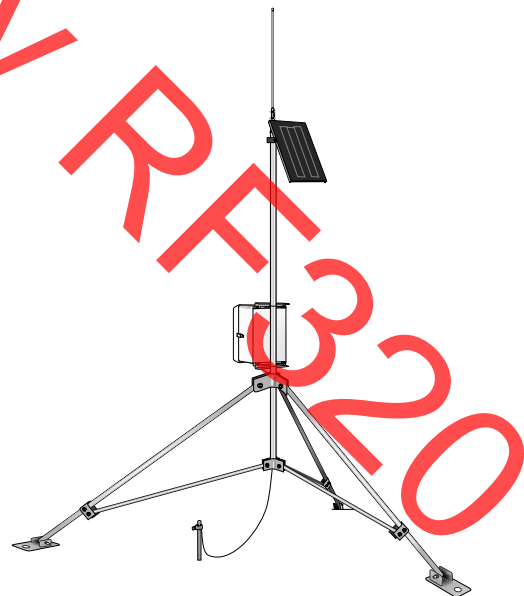
Repeater stations act as communication relays between stations that cannot communicate directly due to distance or obstacles. Repeater stations always use omnidirectional antennas.