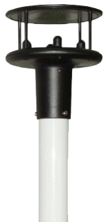
WindSonic-QD 2-D ultrasonic anemometer (ordered as Wind Sensor option -GW).

The 18897 wall charger can recharge the RAWS-F battery during off-season, winter-time storage. This wall charger has a 24 Vac, 1.67 A output and a 110 to 240 Vac input.