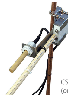
CS516-QD Fuel Sensor (ordered separately)