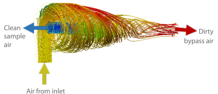
Figure 1. Streamline flows through the vortex. Warmer colors represent higher speeds of dirty air to the right (towards bypass), and cooler colors represent higher speeds of clean air to the left (towards sample cell).