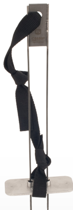
CS650G Rod Insertion Guide