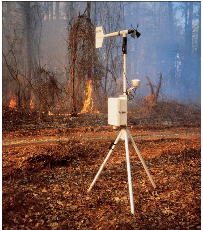
The CR510 supports many applications including the monitoring of fire conditions.

Built with surface-mount technology, the CR510 is a small (8.4" x 1.5" x 3.9"), lightweight (15 oz.) datalogger.