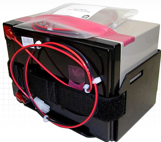
BP12 with standard mounting bracket. The 27758 mounting kit, is also offered if more secure mounting is required.

12 Ah and 24 Ah Rechargeable Power Supplies