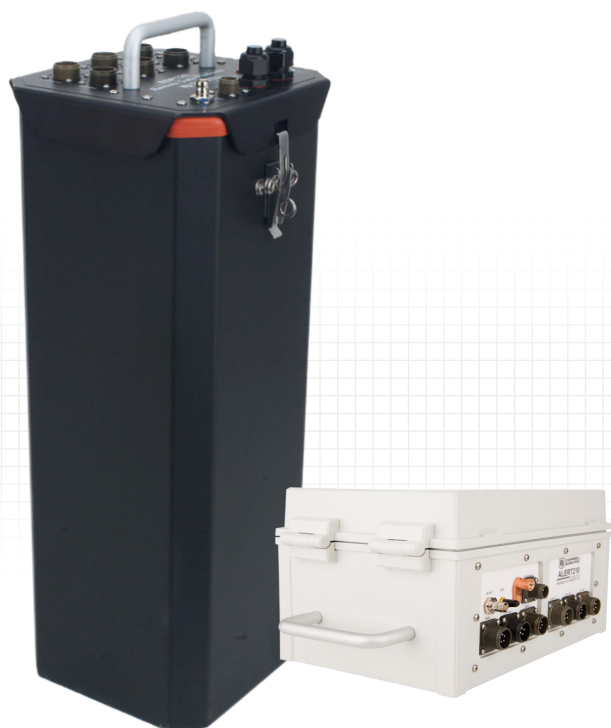
Shown: Standard ALERT210 canister (left) and a custom ALERT210 transmitter (right) designed to customer specifications