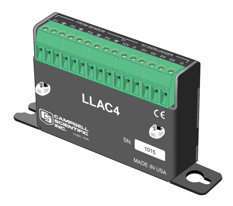
FIGURE 1. LLAC4 four-channel, low-level AC conversion module

The LLAC4 is often used to measure up to four anemometers, and is especially useful for wind profiling applications. Compatible wind sensors include, but are not limited to, the 05103 Wind Monitor, 05106 Wind Monitor-MA, 05305 Wind Monitor-AQ, 03001 Wind Sentry Set, and 03101 Wind Sentry Anemometer.