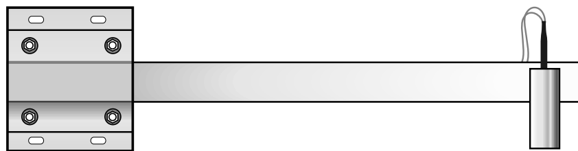
FIGURE 3-1. IRTS-P on UT018 Crossarm

The IRTS-P can be mounted to a Campbell Scientific tripod or tower with the UT018 Crossarm (Figure 3-1.) A mounting kit (Stainless steel bolt, 2 washers, and 2 nuts PN 14475) is included with the IRTS-P that can be used to attach the sensor to the crossarm (Figure 3-2.)