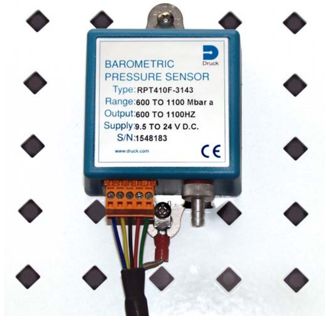
FIGURE 3-1. Mounting CS115

The mounting holes for the sensor are one-inch-centered, and will mount directly onto the holes on the backplates of the Campbell Scientific enclosures. Mount the sensor with the pneumatic connector pointing vertically downwards to prevent condensation collecting in the pressure cavity, and also to ensure that water cannot enter the sensor.