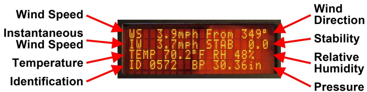
Figure 3. Close-up of data on display – international versions will display metric units

The data on the screen appears as follows: