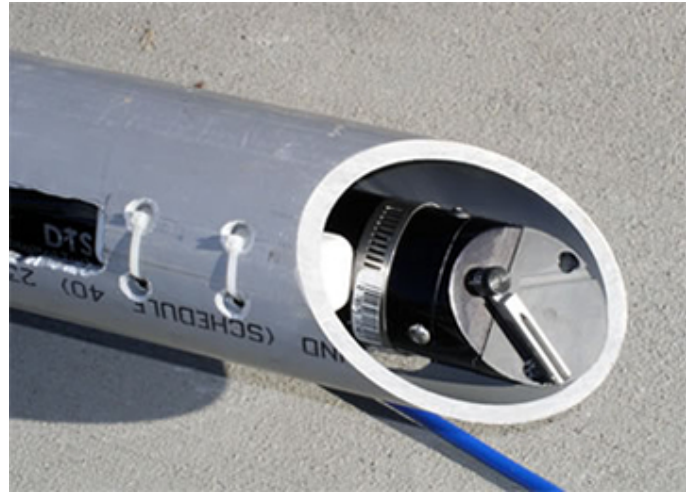
Face of the sensor stand insert showing DTS-12 and CS547