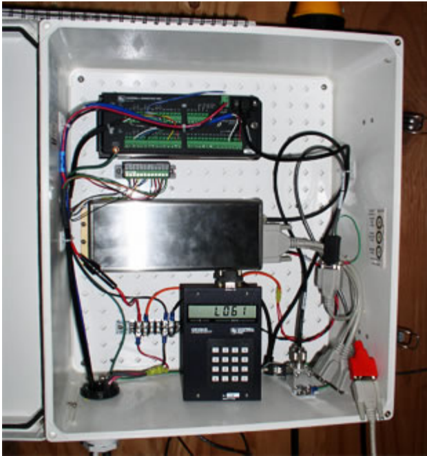
Enclosure with CR10X and MCC low-band radio