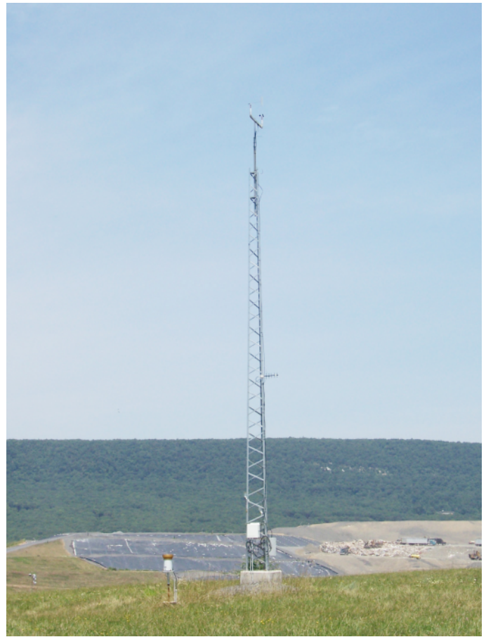
This meteorological tower transmits landfill site conditions via radio.

Landfill managers would much rather prevent environmental problems than have to deal with them after the public has been inconvenienced. Continuous monitoring of environmental variables can be an important part of this effort.