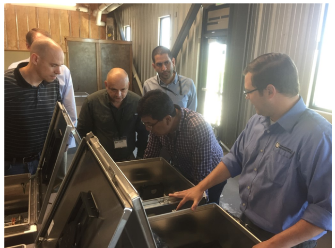
Factory acceptance test in Logan, Utah