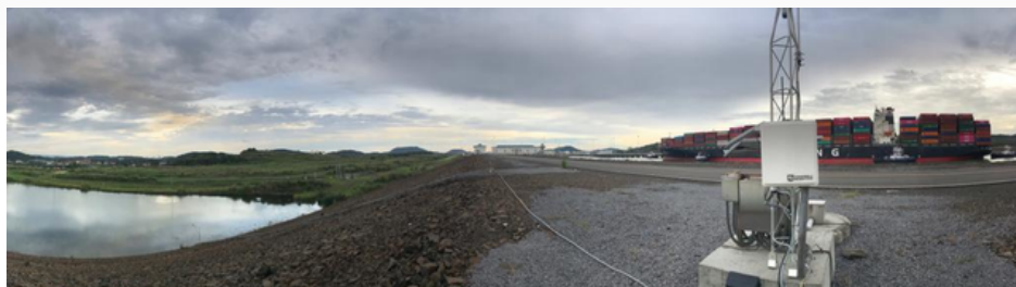
Geotechnical station at new Cocoli Locks, near Cocoli, Panama

Enhanced ALERT2 system for accurate water-level forecasts