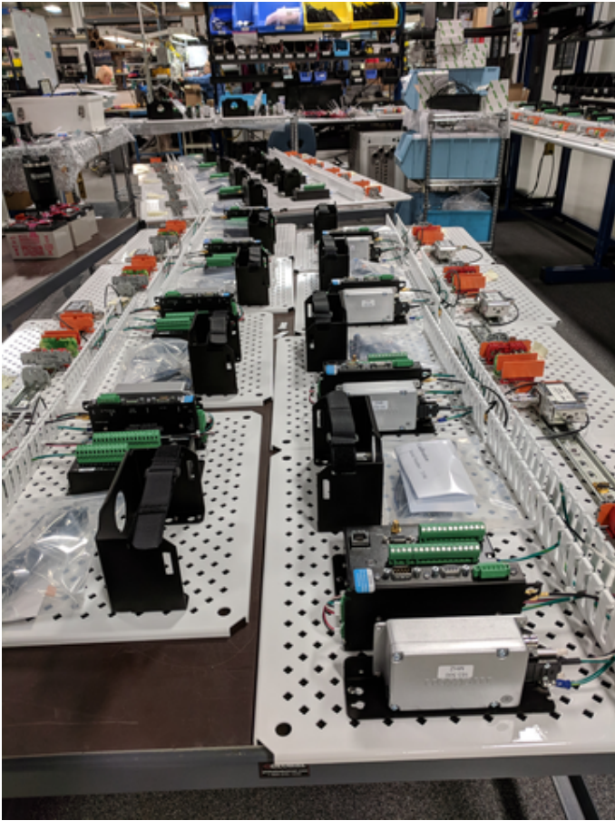
Production of systems