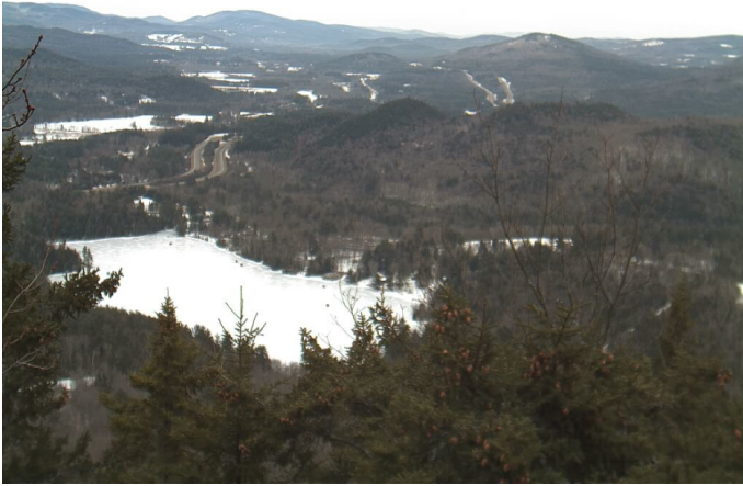
Canal water-level sensor and radio station

Paro Lake Tower, Hubbard Brook Feb 24, 2020 9:21:13