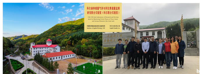
Fig. 4. CAS-CSI Joint Laboratory of Research and Development for Monitoring Forest Fluxes of Trace Gases and Isotope Elements (a) and some team members (b)

View online at: www.campbellsci.com/china-flux