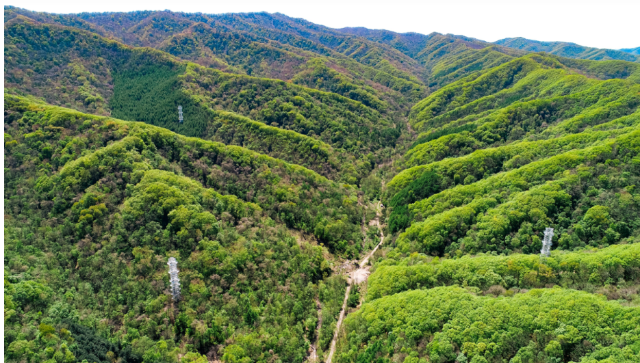
Fig. 1. The three towers facilitating studies on forest ecology and management over the watershed of Qingyuan Forest CERN (China Ecology Research Network, Chinese Academy of Sciences) are located inside three forest sites categorized as natural mixed broadleaf deciduous forest (the left nearest tower), natural Mongolian oak forest (the right tower), and planted larch forest (the farthest tower). The three forests represent the three major types of secondary forest ecosystems in northeast China.

Integrating CPEC310 and AP200 systems to explore the theories and techniques of measuring fluxes