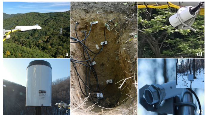
Fig. 3 Micrometeorology sensors: (a) CNR4 four-component radiometer with CNF4 ventilation and heating accessories, (b) sensor assembly for soil heat flux, along with soil moisture and temperature profiles, (c) 52202 rain gauge, and SI-111 infrared radiometer outside (d1) and inside (d2) forest