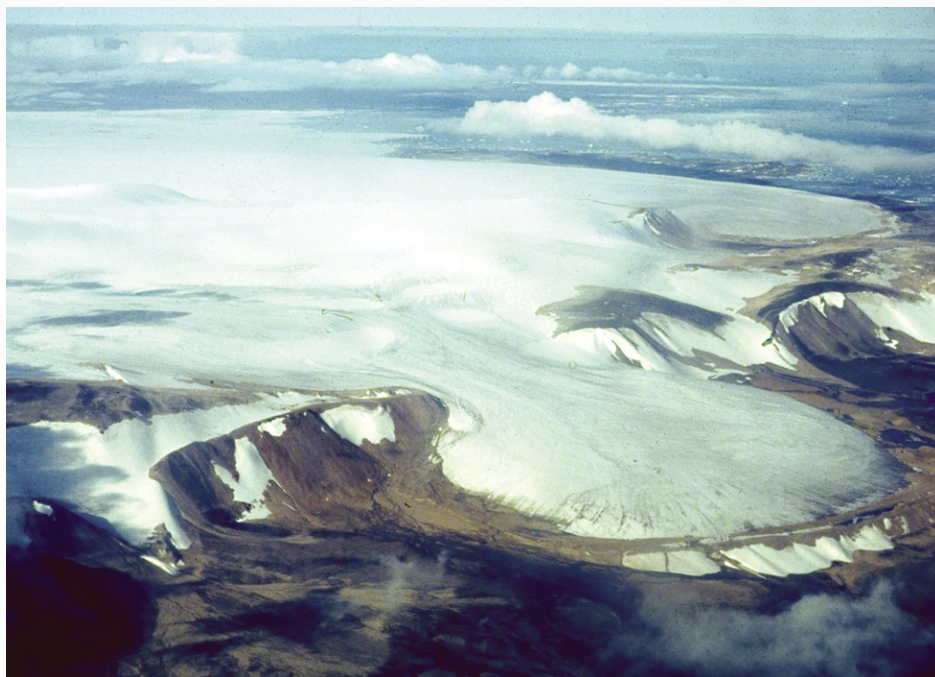
The southern edge of Devon Island Ice Cap in Nunavut, Canada, lies within the research area, where long-term data are being collected to study global warming.

Campbell Scientific equipment helps detail global warming in Canada's extreme north