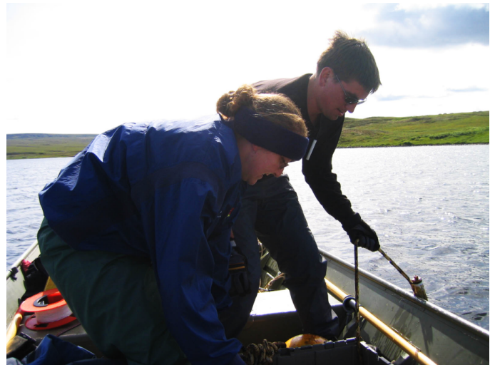
Researchers monitoring the thermal stratification in Toolik Lake

Researchers are also interested in time-series oxygen measurements paired with temperature measurements. These measurements allow scientists to quantify the metabolism of a lake, that is, how much the phytoplankton and bacteria are growing. Changes in oxygen at different depths are also indicative of remineralization, the process which transforms organic matter to inorganic nutrients. In addition, time-series oxygen and temperature measurements are essential for determining how much of a lake is suitable for the growth and survival of fish. For example, with high loading of nutrients or insufficient mixing, oxygen depletion occurs at depth, causing a loss of habitat suitable for fish. This problem may be exacerbated by a changing climate.