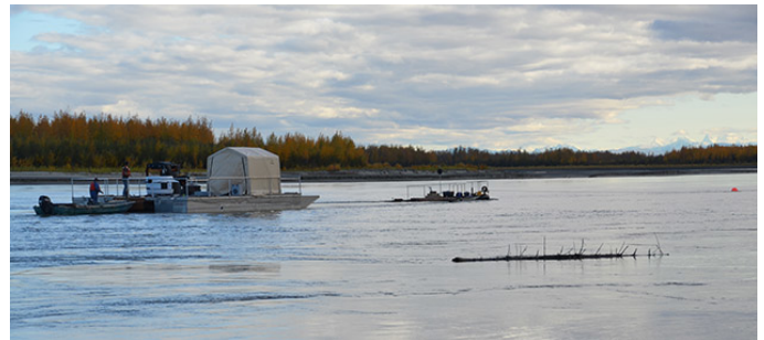
A river hydrokinetic test site on the Tanana River