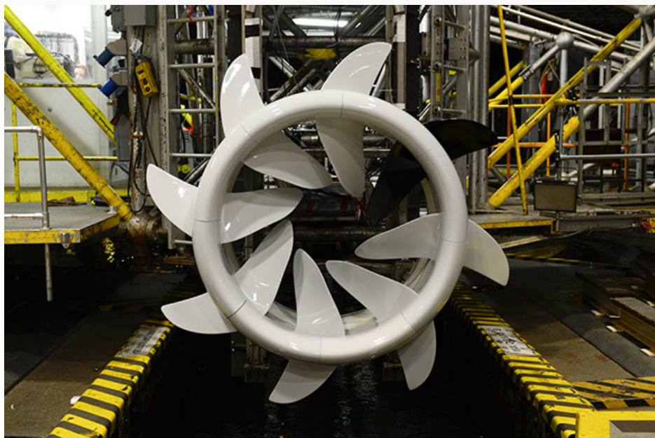
The hydrokinetic turbine developed by Oceana Energy Company

Campbell CR9000X used for in-stream hydrokinetic device evaluation